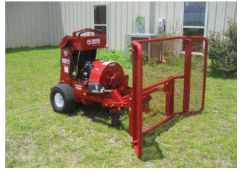
LEAF PUSHER ATTACHMENT #BLP4872

48-in. tall x 72-in. wide Requires Attachment Lift Unit (#ALU4000)